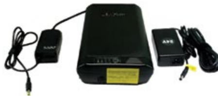
High-performance lithium ion battery with power supply