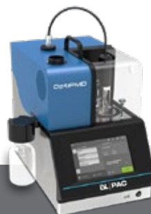
OptiPMD Micro Distillation Analyzer