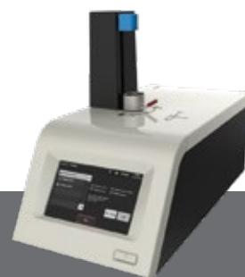
VIDA Density Meter