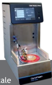
OptiFlash Small Scale Flash Point Analyzer